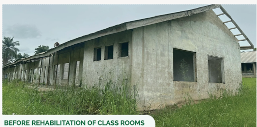
BEFORE REHABILITATION OF CLASS ROOMS

ECEWS Empowers Girls with Lifesaving Health Skills at WOGEEI Bootcamp