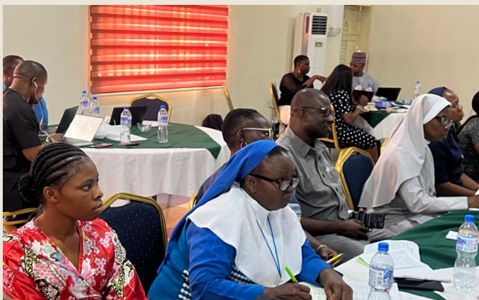
A cross Section of Participants at the training