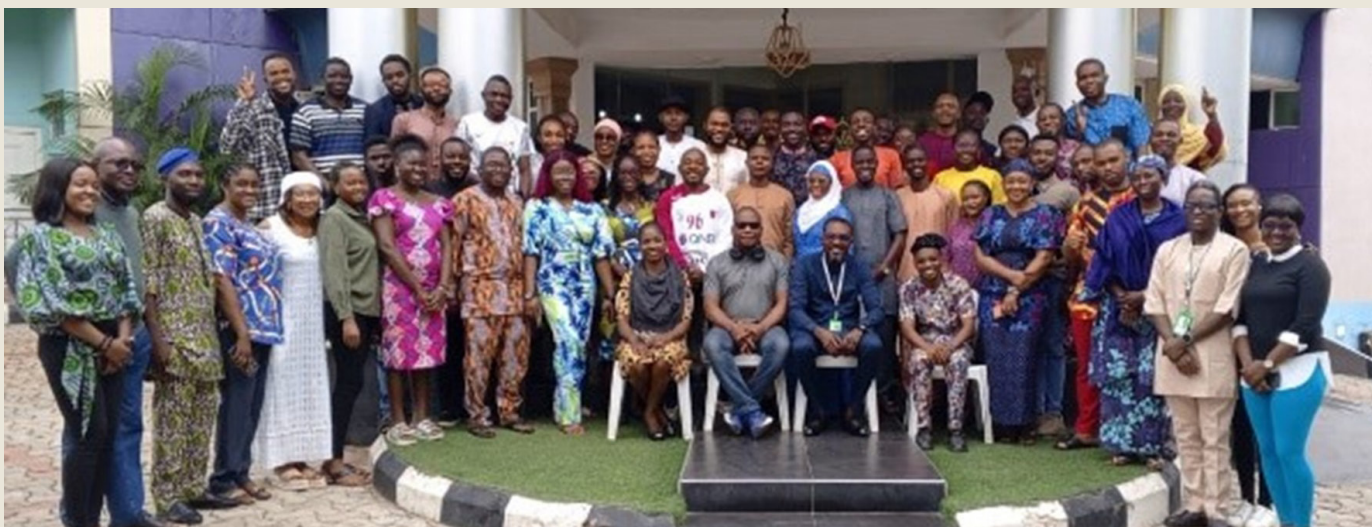
Group photograph of Director of SI, Osun State Agency for the Control of AIDS (OSACA) and Participants

In a bid to enhance data collection, and reporting, and ensure data accuracy, ECEWS recently organised a comprehensive 5-day integrated training for SI ad-hoc staff in Osun State. The training brought together Monitoring and Evaluation (M&E) assistants from facilities and communities, data entry assistants, Strategic Information (SI) interns, and M&E personnel from partner CBOs (Community-based Organisations). The primary aim was to strengthen the skills of M&E personnel across three states by implementing the Center for Disease Control- Sustainable Program for HIV Epidemic Control and Equitable Service Delivery (CDC-SPEED) Project, focusing on improving data management and program effectiveness.