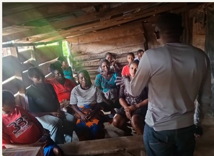
Community PMTCT Intervention in Ikrom LGA

A competency-based assessment was conducted to pinpoint areas requiring improvement, marking the start of a quality improvement journey aimed at ensuring consistency and high quality in communities located across Akwa Ibom and Cross River States. This training is part of ECEWS' initiative to strengthen the capacity of birth centers to deliver quality services to pregnant women and reduce mother-to-child transmission of HIV.