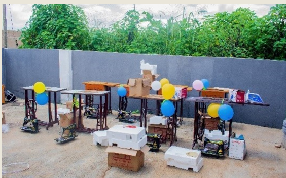
Startup kits distributed to 12VC who were enrolled in FY23 into Skill acquisition

ECEWS, in collaboration with her partner Living Word Mission (LIWOM), distributed start-up kits to 12 vulnerable children enrolled in its Vocational Skill Acquisition Centers across the 16 LGAs in Ekiti state. These beneficiaries were selected based on an assessment highlighting their outstanding performance in regular attendance, positive attitude, and accelerated learning. The start-up kits included 10 sewing machines with pressing irons, a complete make-up kit box, phone-repairing tools, and a hair dryer with hairdressing equipment. In addition, income-generating materials were distributed to 14 caregivers engaged in small-scale businesses, aiming to bolster their entrepreneurial efforts and provide a pathway to financial independence.