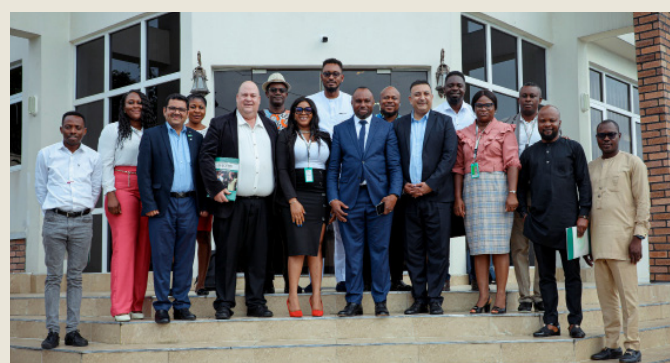
Group photograph of the Abbott and ECEWS team.