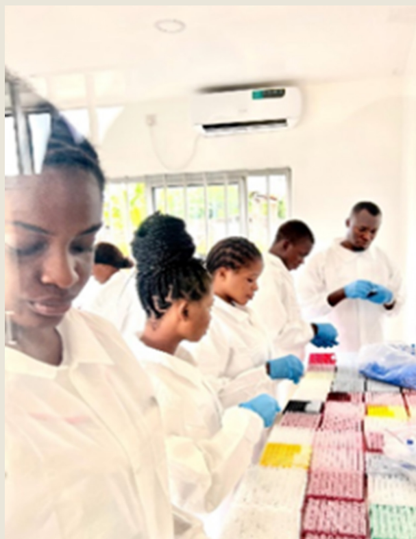
DST production by lab team at IDH-DLHMH