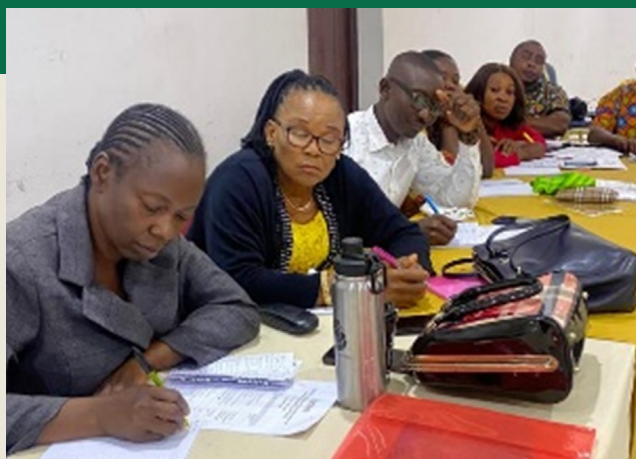
Cross-section of participants during the training

The USAID-funded ACE-5 project implemented by ECEWS, in collaboration with the Cross River State Ministry of Health, organized a 3-day training for ART (Antiretroviral Therapy) Coordinators across 38 healthcare facilities in Cross River State. Held from August 26th to 28th, 2024, the training focused on national treatment guidelines, best practices, approaches, and the National Monitoring and Evaluation Reference Guide. The training is part of ECEWS' initiative to strengthen the ownership of the HIV response by government counterparts, improving the capabilities of program heads and staff at supported facilities, and boosting health outcomes through capacity building and system strengthening.