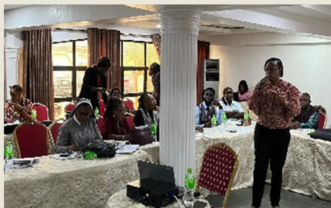
Cross Section of participants at the logistics management training

By improving the efficiency of supply chain management, this training is expected to significantly