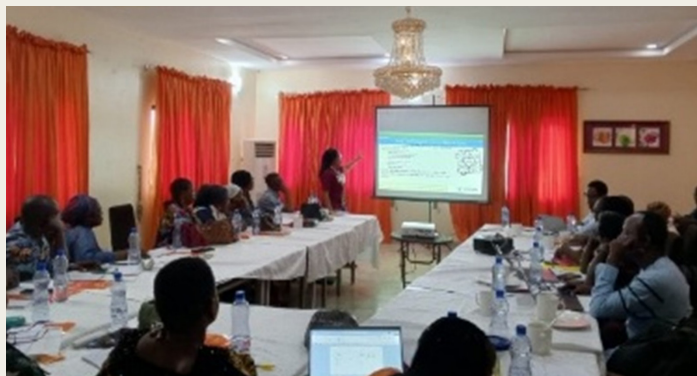
A cross section of participants