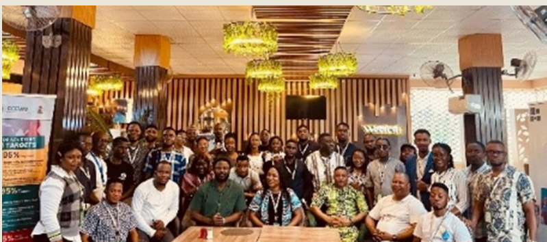
Group photo of participants