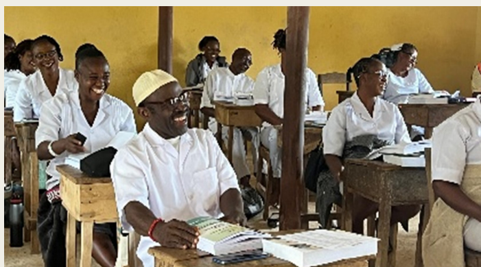
A cross section of participants at the training

This dual initiative strengthened the capacity of social workers and health professionals, empowering them to better address public health challenges and improve outcomes for vulnerable populations in Ekiti and Osun States.