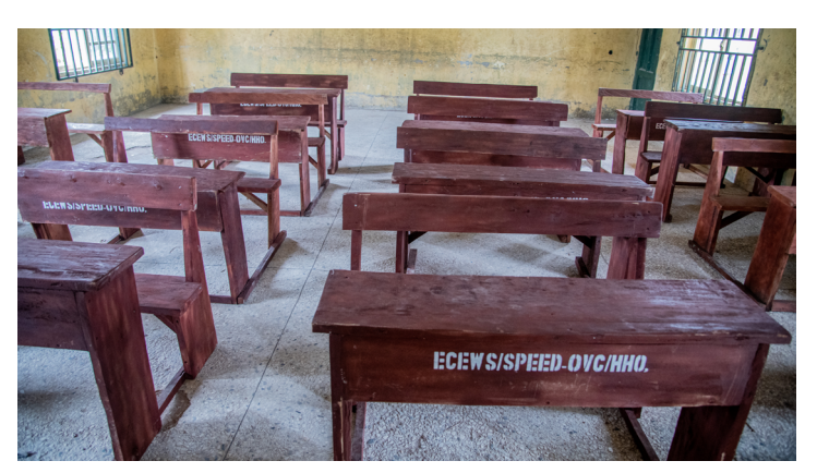
15 three seater desk launched at Umutu Mixed Secondary School