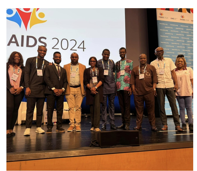
The ECEWS team in a group photograph