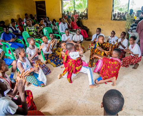
Students of Okpe Mixed Secondary School expressing thier joy for this great support through cultural dance