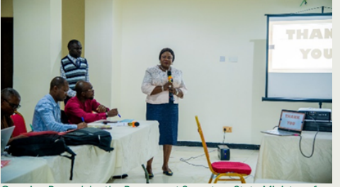
Group photograph of participants at the HIV Programme Ret