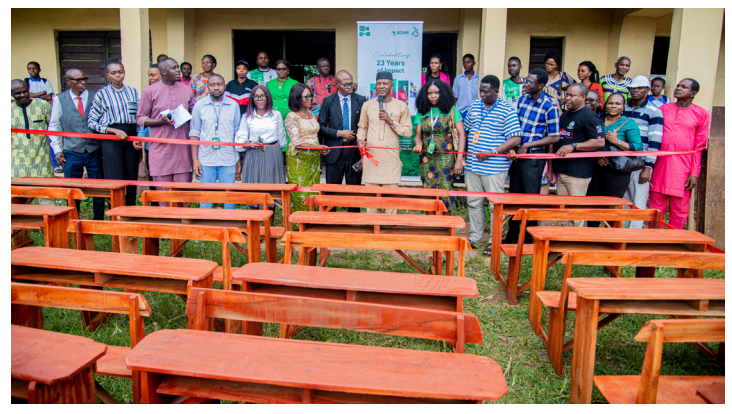
20 three seater desk launched at Okpe Mixed Secondary School at Abavo Community