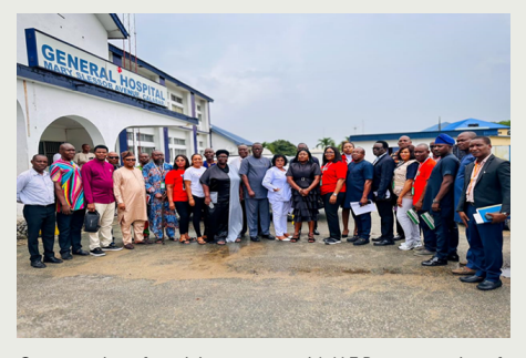
Cross section of participant poses with H.E Representative after the opening ceremony/flag off of the free surgical mission

Neglected Tropical Diseases (NTDs) are a diverse group of medical conditions that affect people living in impoverished communities. Prioritising these communities, ECEWS in collaboration with the Cross River State Ministry of Health, conducted a pilot program to provide free hydrocele surgeries for 10 indigent individuals out of 64 identified cases across four LGAs in the state. This initiative aimed to strengthen the health system by offering necessary surgical interventions for those with hydrocele in vulnerable communities, building the capacity of surgeons in