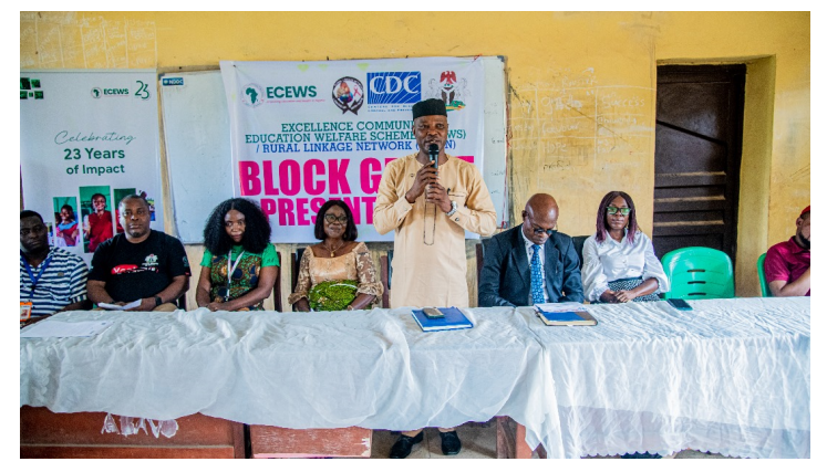
The representative of the Honourable Commissioner Ministry of Education Dr Mike Emeshili giving an opening remark during the Educational Block grant launch at Okpe Mixed Secondary where he appreciated the Management of ECEWS for supporting development of the Education Sector in Delta State and also asked for more support.