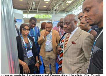
Honourable Minister of State for Health, Dr. Tunji Alausa visits the ECEWS exhibition booth