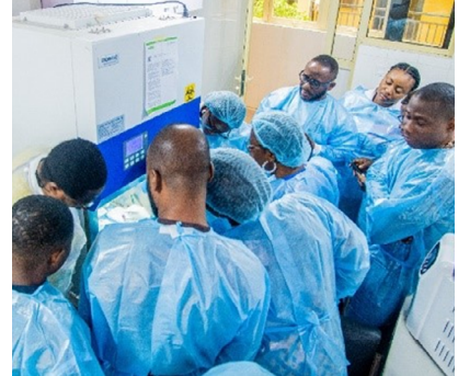
Cartridge preparation in the biosafety cabinet during GeneXpert training and site activation @the Molecular lab FMC Asaba

Thirty-two (32) participants, including 13 staff from supported facilities, HMB, Delta State Ministry of Health, and ECEWS project staff had their capacity built on the use and maintenance of the 16-module GeneXpert machine. ECEWS remains committed to the improvement of healthcare delivery in the communities that we serve.